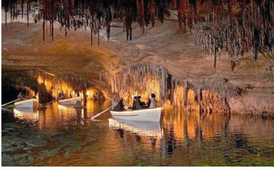
Cuevas del Drach